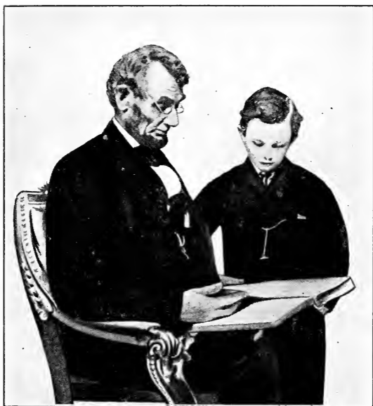
LINCOLN AND HIS SON "TAD."

From photograph taken while Lincoln was President.